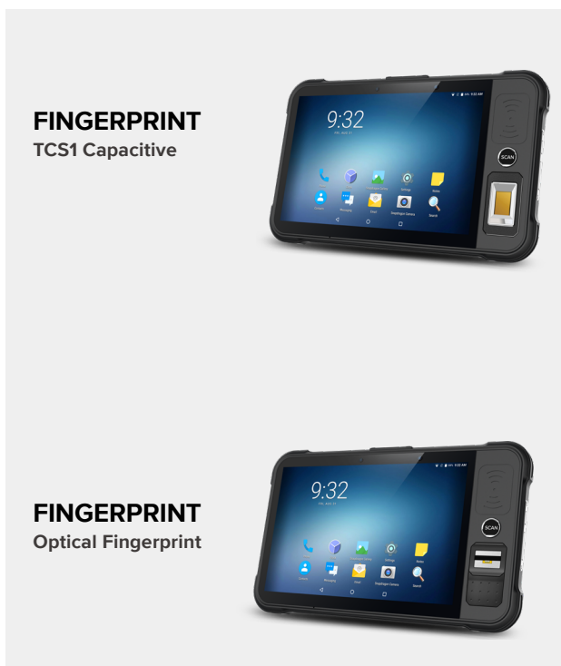
FINGERPRINT TCS1 Capacitive

Accurate Fingerprint Reading and Facial Recognition